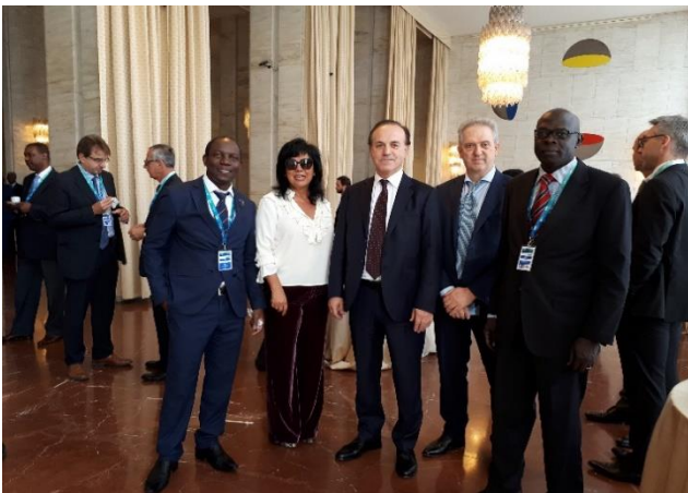
Some delegates at the ICA Conference Meeting in Rome

The 13th annual meeting of the Infrastructure Consortium for Africa (ICA) was jointly organized by the African Development Bank (AfDB) and the Government of Italy and was held in Rome from 19 to 20 October 2017. The theme for the conference meeting was "Towards the Promotion of Smart and Integrated Infrastructure for Africa: An agenda for Digitalization, Decarbonisation and Mobility." African Regional Economic Communities (RECs), specialized institution such power pools, and the Corridor Management Institutions were identified as key stakeholders of ICA and were invited to this conference meeting. Papers on promoting smart infrastructure in Africa, digitisation technology, decarbonisation of energy, and world energy outlook were presented. ICA also presented its 2016 annual report on infrastructure financing trends in Africa and findings of the performance of African power pools. The Government of Italy pledged continued support for development of infrastructure in Africa. The SAPP was represented by the Operations Engineer.