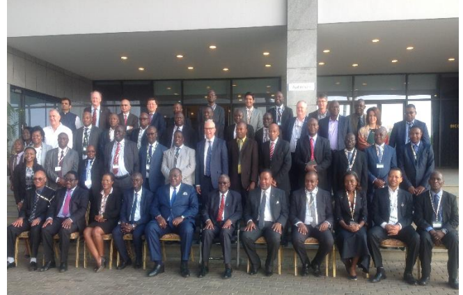
Honourable Minister of Natural Resources, Energy and Mining, and SAPP Executive Committee Members

to have the non-operating members Angola, Malawi and Tanzania to be connected to the SAPP grid as the interconnections brings diversity of energy resources.